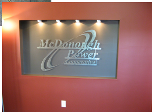
Laser cut Stainless Steel Sign